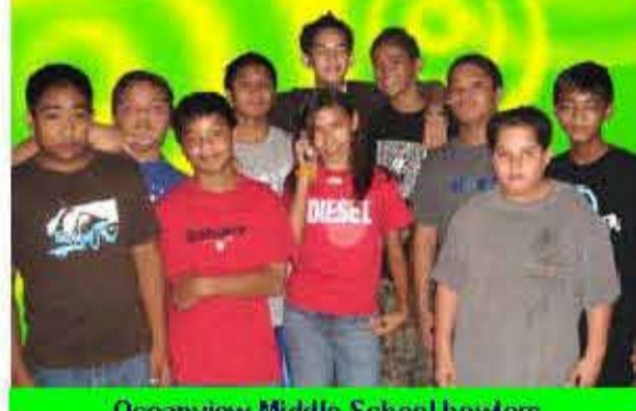
Oceanview Middle School bowlers