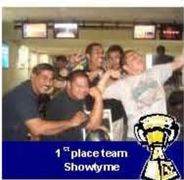
1 st place team Showtyme