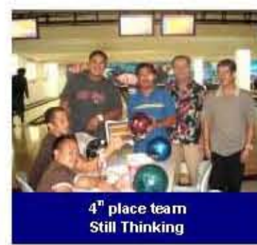
4 th place team Still Thinking