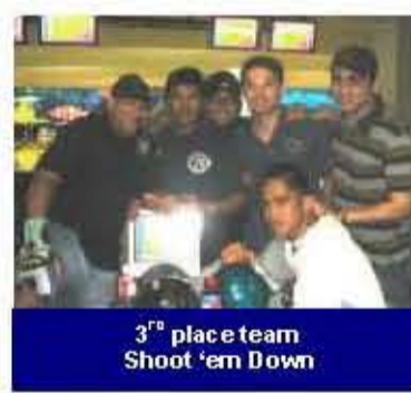
3 rd place team Shoot 'em Down