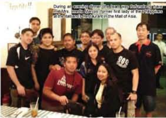
During an evening dinner the team was fortunate to have met Mrs. Imelda Marcos, former first lady of the Philippines at the Italiano Restaurant in the Mall of Asia.